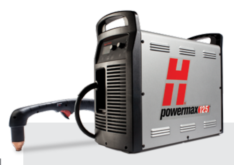
Duramax Hyamp standard torch styles (for more torch options, see www.hypertherm.com)